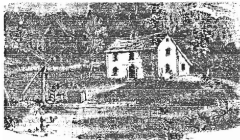
An early Cutler farmstead, sold by the Cutlers in 1771 to the Parker family.